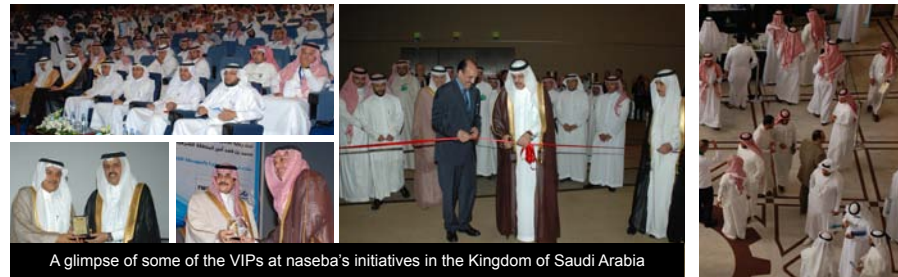
A glimpse of some of the VIPs at naseba's initiatives in the Kingdom of Saudi Arabia